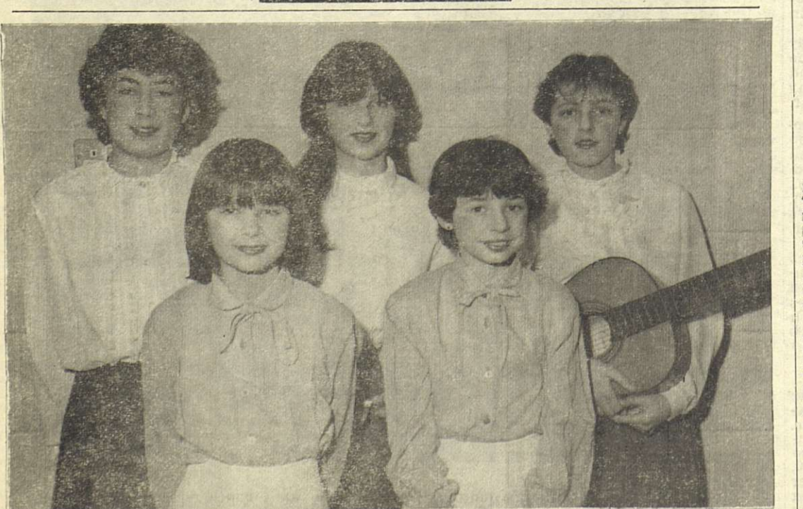
Dungarvan Ballad Group, who competed in the Waterford Scor na nOg county finals which were held in Kill Community Centre recently.

Mon-Fri. 8 pm - 10 pm 32 The Mall. Waterford.