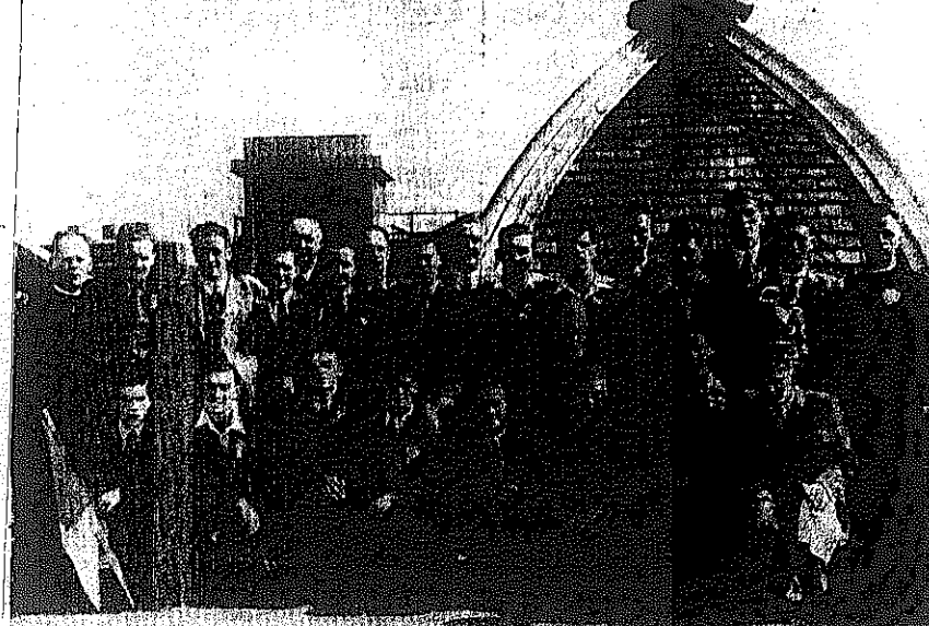
The photo in our "Remembering Other Days" series this week was one taken on the roof of Independent House, Middle Abbey Street, Dublin in September 1948, the day after the Waterford Minor Hurling team defeated Kilkenny, 3-8 to 4-2, in the All-Ireland Final...