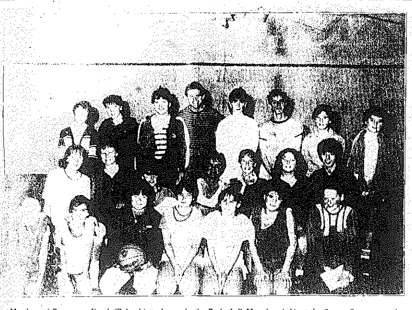
Members of Dungarvan Youth Club who took part in the Basketball Marathon held at the Sports Centre recently.