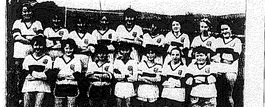
Ballinacree, who defeated Ardmore in the Ladies Football County Final (B Section) at the Friary Grounds, Dungarvan recently.