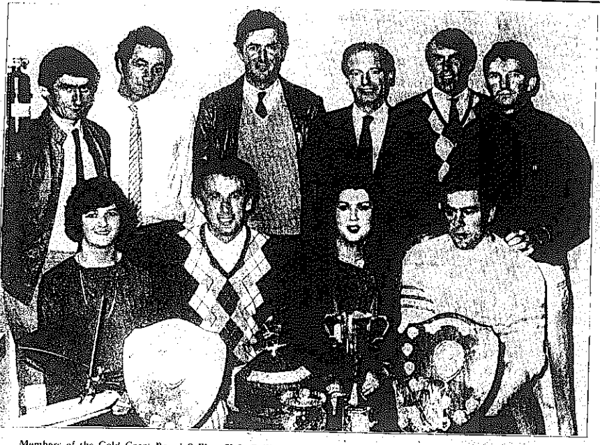
Members of the Gold Coast Board Sailing Club, Ballinacourty, with trophies won in competitions throughout the season.