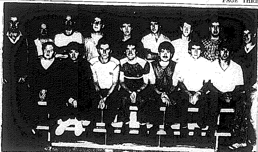
Members of Abbeyside United A.F.C. who took part in the 24 Hour Soccer Marathon at the Sports Centre, Dungarvan, recently.

There's absolutely no let up for these days, and next Sunday our intermediate hurlers renew the battle with Abbeyside in a Western championship final that is being very eagerly awaited.