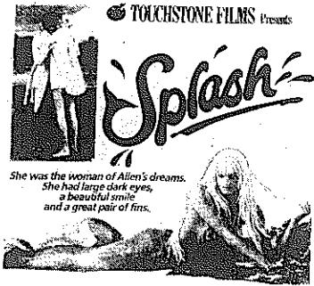
She was the woman of Allen's dreams. She had large dark eyes, a beautiful smile and a great pair of fins.