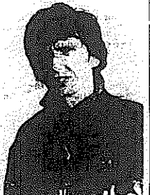
JOHN TREACY Olympic Silver Medalist

"I offer you my sincerest congratulations and good wishes," the President stated in his congratulatory telegram to John. "You have won deserved acclaim and honour for Ireland with your Olympic performance. We are all proud of you," President Hillery said, "and speaking on behalf of all the people of Ireland."