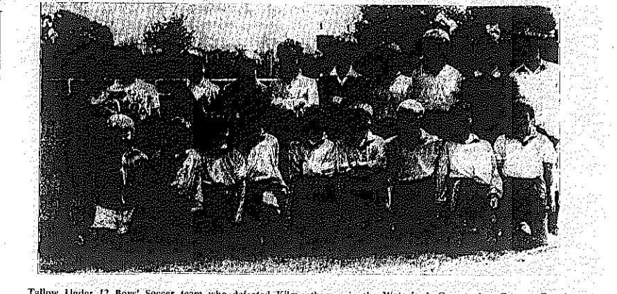
Tallow Under 12 Boys' Soccer team who defeated Kilmacthomas in the Waterford Community Games County Final.