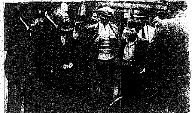
The photos for our "Remembering Other Days" series this week are street scenes of Dungarvan as it was more than thirty years ago. On top is a view of O'Connell Street looking towards the Square, decorated with bunting, prohibitions had not even been thought of in those days. At bottom is a typical scene of an old fair day at the Square as a fast-talking trick-of-the-loop man attracts an audience. In the background may be seen Conroy's public house and Greene's Cafe which were well-known landmarks at the Square in those days.