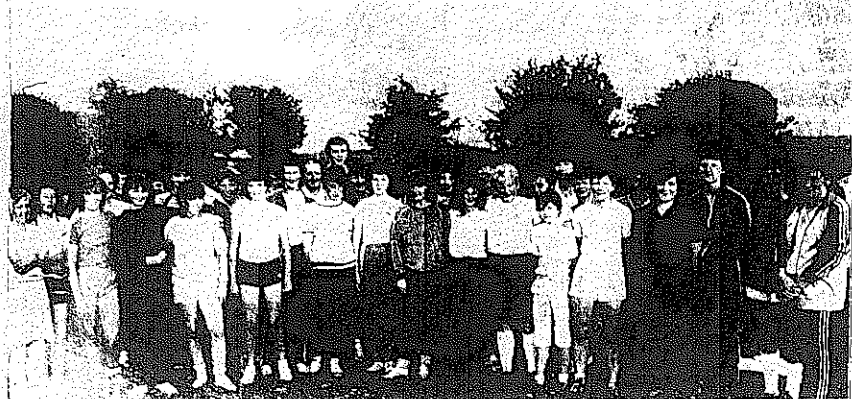
Girls who took part in the 12-a-side Married v. Singles Football Final at the Deise Festival, Bohadoun recently.