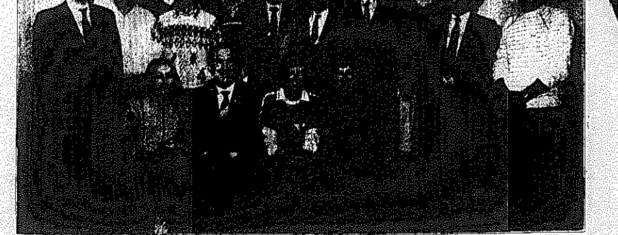
Pictured above are the Munster Executive Committee members and delegates who were responsible for the successful running of the Munster Community Games Finals...