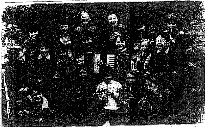
Young musicians of the Dungarvan V.E.C. School of Music who took part in the Festival of Music in the Friary Hall, Dungarvan, recently.

They grew up on the outside - They were looking to belong