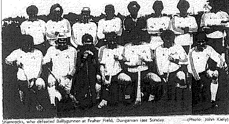
Shamrocks, who defeated Ballygunner at Fraher Field, Dungarvan last Sunday.

Shamrocks and Ballygunner had a real battle in this senior hurling qualifying game which produced a cliff hanger finish at Fraher Field, Dungarvan, on Sunday last.