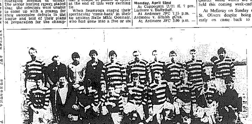
Lismore, who defeated De La Salle at the Fraher Field, Dungarvan on Sunday last.