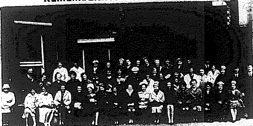
For the photo in our "Remembering Other Days" feature this week it could be a case for many of you who find yourself in it! The photo shows a group of members of the I.O.A. drawn from practically every guild in Co. Waterford...