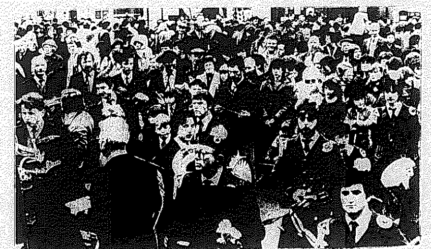
A section of the crowd who were present at the St. Patrick's Day Industrial Parade in Dungarvan.

IMPORTANT NOTICE KNOCKANORE, GLENDINE, KILWATERMOY COMMUNITY COUNCIL IS HOLDING A Public Meeting in Knockanore Monday, March 26th at 8 p.m. TO ADOPT A CONSTITUTION FOR THE COUNCIL. ALL PARISHIONERS INVITED TO ATTEND.