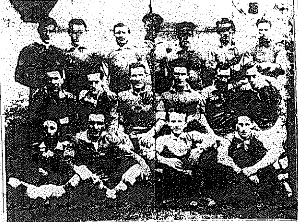
The heading to the photograph above in our "Remembering Other Days" feature this week speaks for itself and recalls the times when Waterford teams, both football and hurling were able to go out and win titles.