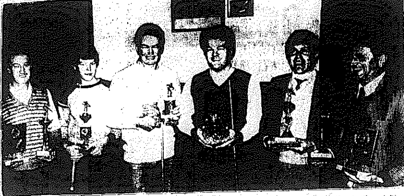
Members of Dungarvan Commercial Club pictured with their Snooker League Trophies last weekend. (From left) ...