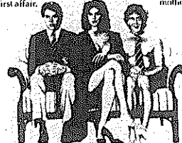
THE CLASS with RUI LOUVE, MACQUELINE UEBET, ANDREW MCCARTHY, EILEEN ROBERTSON

The good news is Jonathan's having his first affair. The bad news is she's his roommate's mother.