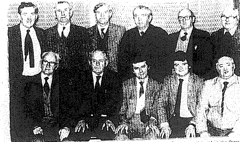
Officers of the Waterford County G.A.A. Board and members of the Steering Committee pictured at the Press Conference.

The Waterford County G.A.A. Board's centenary County and Club Centenary Development Fund was officially launched at a press conference in the town hall, Dungarvan, last week. The fund is to be used to develop the county grounds in the city and Dungarvan.