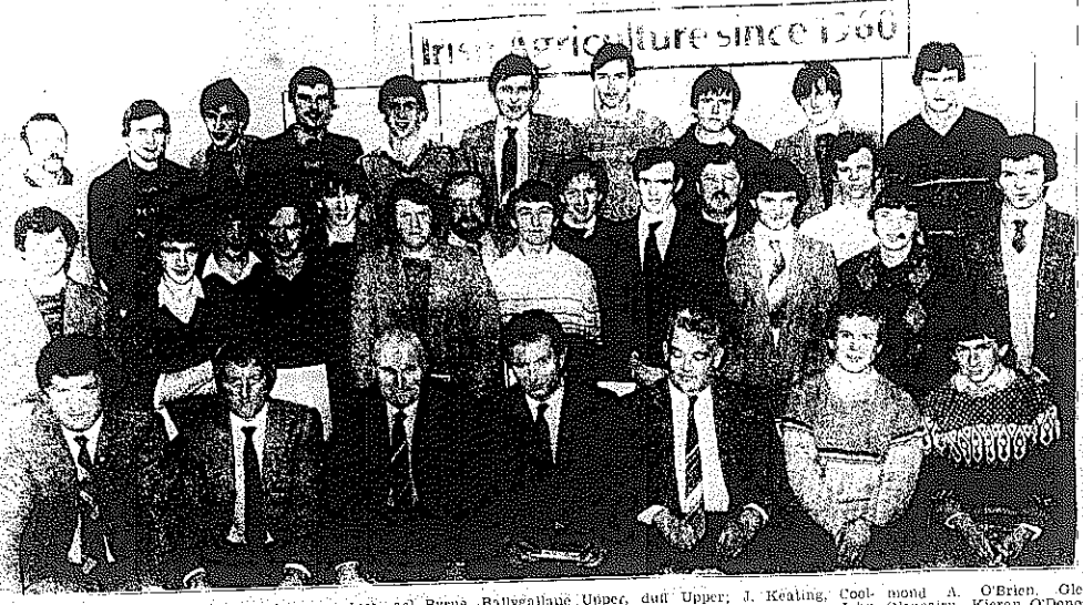
SUCCESSFUL YOUNG WEST WATERFORD FARMERS... The picture above was taken at the O.C.O.T. Centre in Lis...