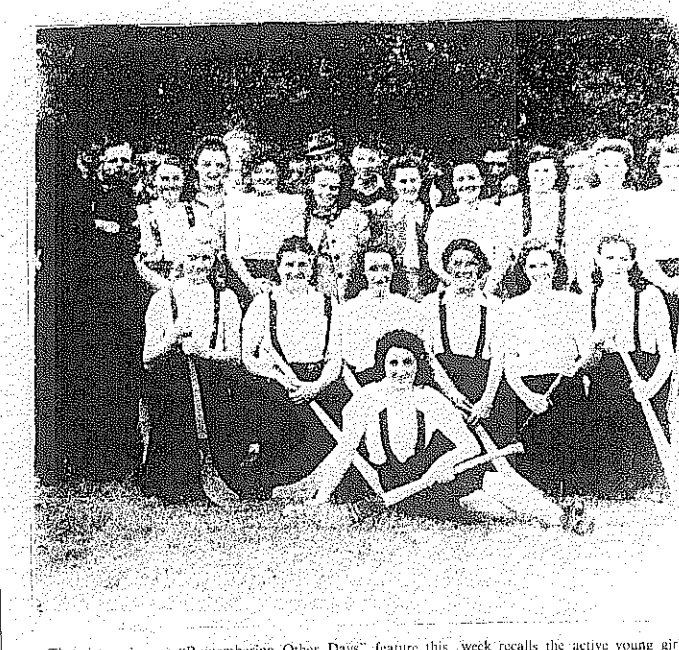
The picture in our "Remembering Other Days" feature this week recalls the active young girls of yesteryear. It is a photo of the Ballyduff Upper Camogie team of 1944 who are today responsible for the revival of camogie throughout the county...