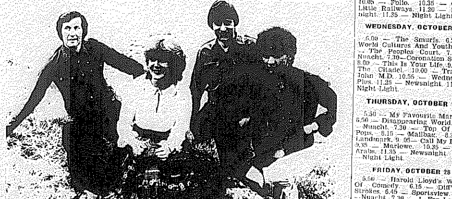
THE BARDS - who are appearing at the Lions Club Cabaret at Friary College, Dickswood, Dungarvan on Monday, October 31.

Featuring music from 'Barnum', 'The Pirates of Penzance', 'Flora Dora' and lots more. Tickets: £2.50 (bookable) Phone Ballyduff 157.