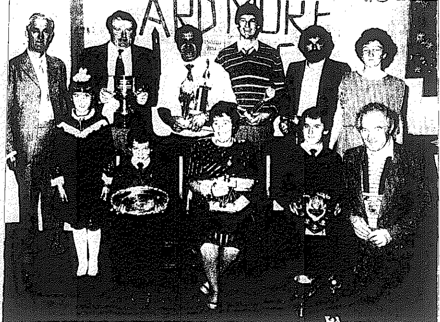
Pictured at Ardmore S.A.C. annual dinner/dance and prizegiving at Lawlor's Hotel, Dungarvan. Front row (l to r)...