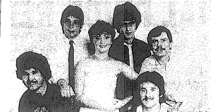
THE MIAMI who will be playing at Hotel Lismore, on Sunday night next, Jan. 23.