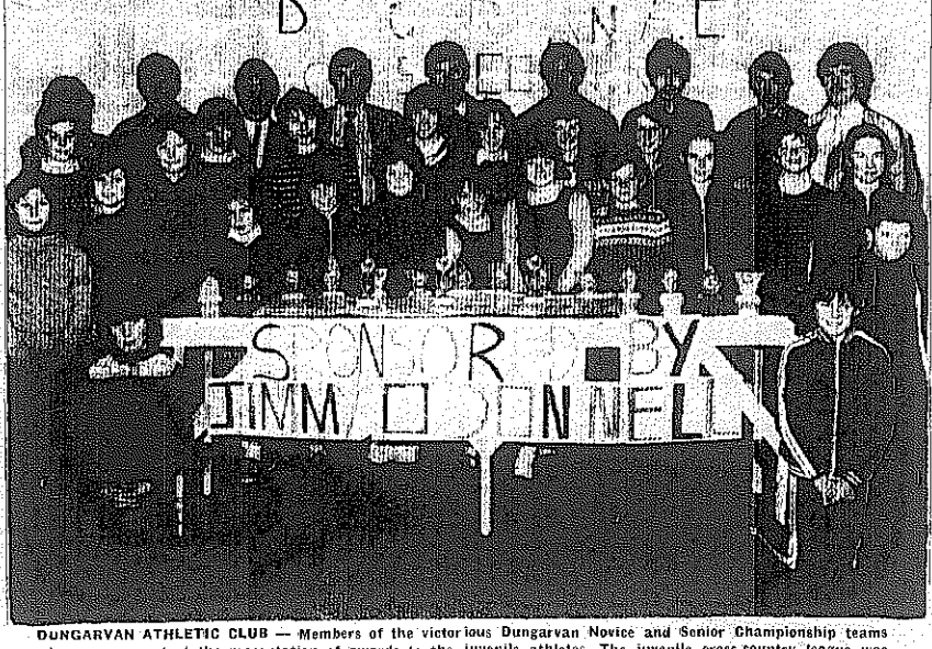
DUNGARVAN ATHLETIC CLUB — Members of the victorious Dungarvan Novice and Senior Championship teams who were present at the presentation of awards to the juvenile athletes. The juvenile cross country league was sponsored by Jimmy O'Donnell Sportswear, Mary Street.