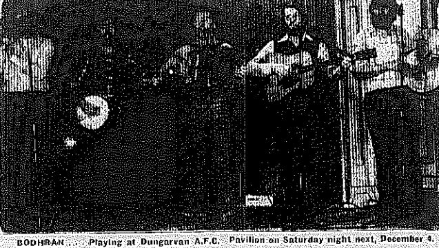
BODHRAN. Playing at Dungarvan A.F.C. Pavilion on Saturday night next, December 4.