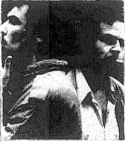
SCULLION... Playing at Minnies Lounge Bars, Abbeyside on Thursday night next, December 2. Tickets may be purchased at Minnies or Ben's, The Record Shop, O'Connell Street, Dungarvan.