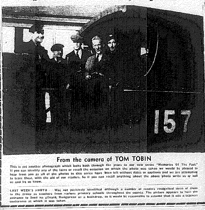
This is yet another photograph which looks back through the years in our new series 'Memories of the Past.' It is an identifiable any of the faces or recall the occasion on which the photo was taken we would be pleased to hear from you as all of the photos in this series have been left without dates or captions and we are attempting to trace these, with the aid of our readers. So if you can recall anything about the above photo write us or call us and let us know.