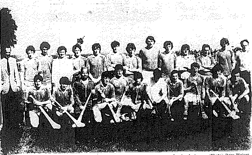
SENIOR HURLING CHAMPIONS BALLYDUFF, who won the title for the first time on Sunday last.