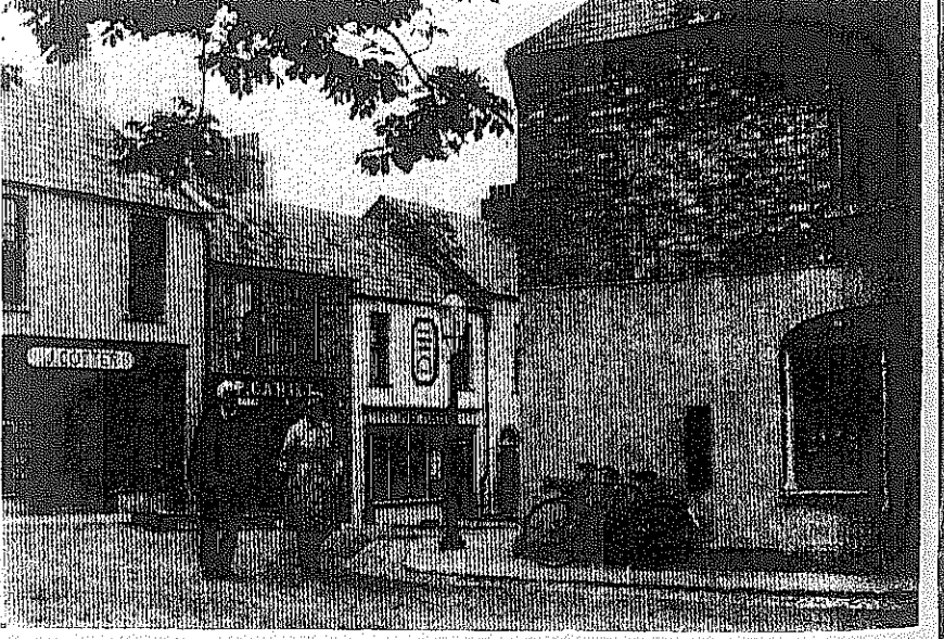
Bunnary's "Street of Memories." The Post Office is on the right.