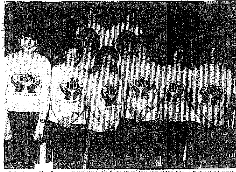
Tallow team of Dungarvan dancers who competed in the Dungarvan Disco Competition held in Malrow...