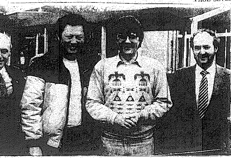
Pictured at the Irish Professional Photographers' Association's Annual Conference in Killybeggs, Co. Londonderry...