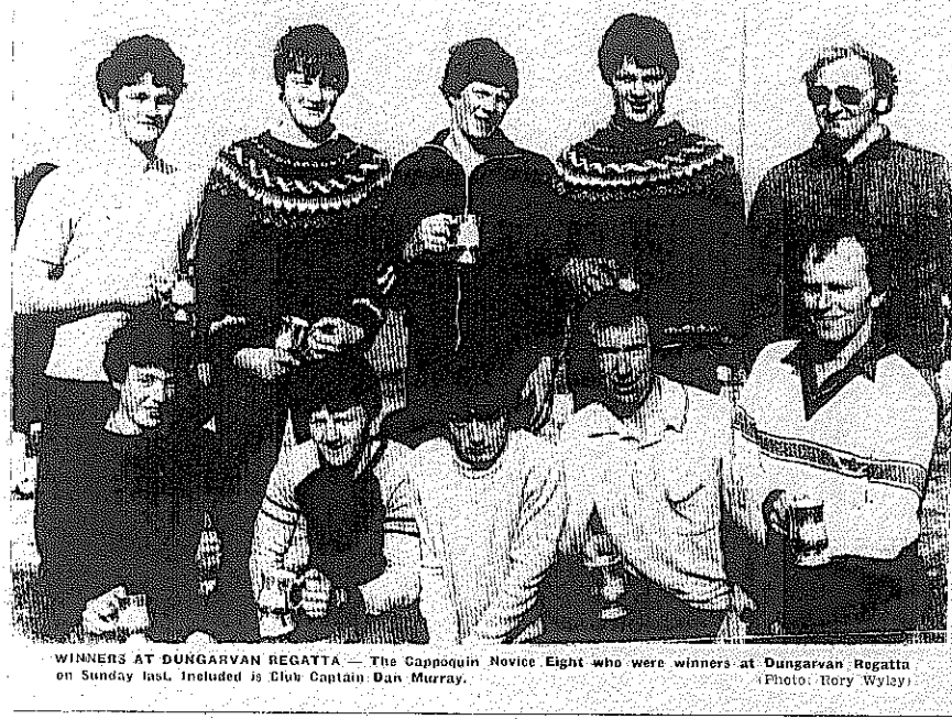
WINNERS AT DUNGARVAN REGATTA - The Cappoquin Novice Eight who were winners at Dungarvan Regatta on Sunday last...