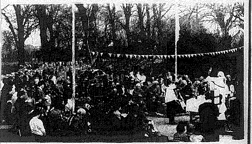
The scene during Benediction of the Blessed Sacrament following the Blessing of the Statue of Our Lady in the Abbeyside National School grounds

UNDER 12 HURLING CHAMPIONSHIP At Lismore on Sunday next our hurling teams are scheduled to play Shamrocks in the first round of the championship. As I consider these hurlers the exact starting time is not known.