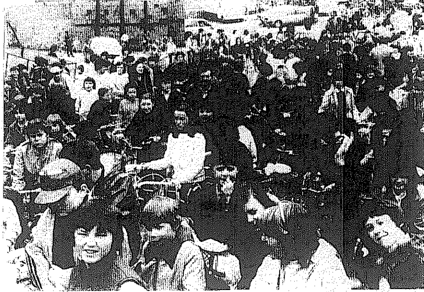
WAITING FOR THE START — Some of the cyclists who took part in the Dungarvan Lions Club 20-mile sponsored cycle on Easter Sunday waiting for the start at Dungarvan Car Park. (See "Spotlight" Column for story.)