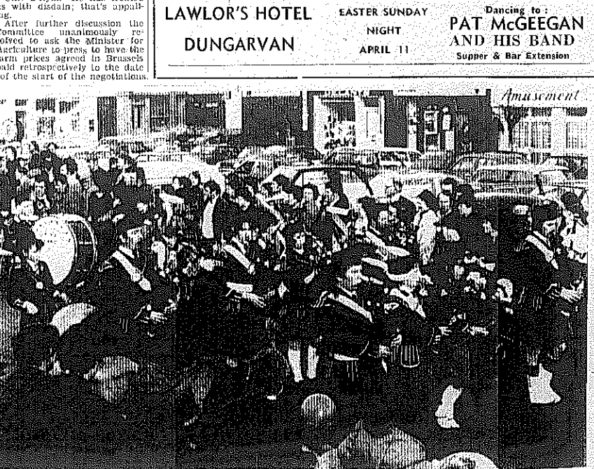
Dungarvan Pipe Band leading Dungarvan's St. Patrick's Day Industrial Parade past the reviewing stand in the Square.

The final tournament of the season commenced on Monday night last. The tournament was held at the Dungarvan Club and was most successful.