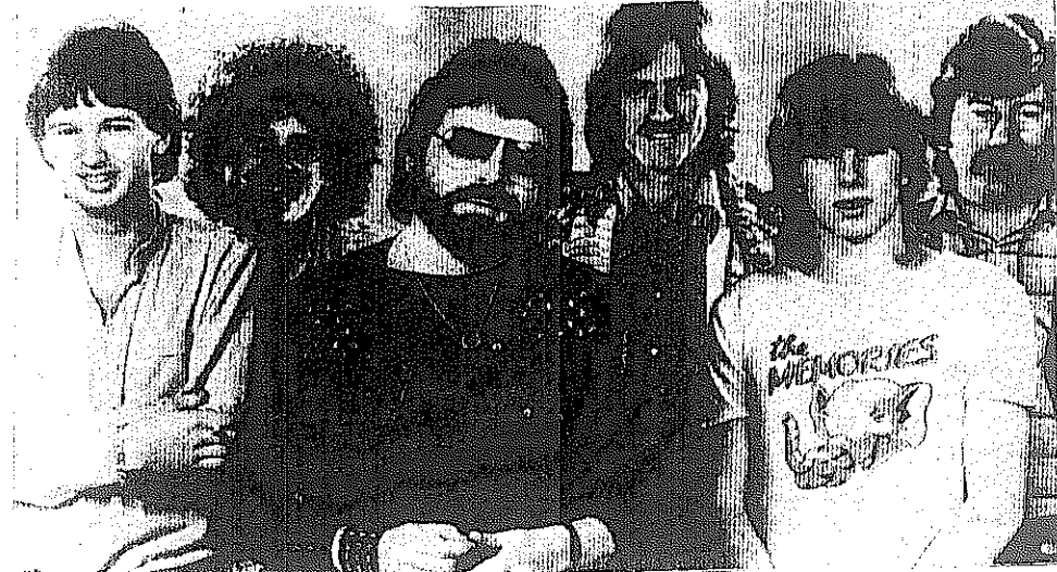
THE MEMORIES — Playing at Kill Summer Festival on Sunday night next, July 4.