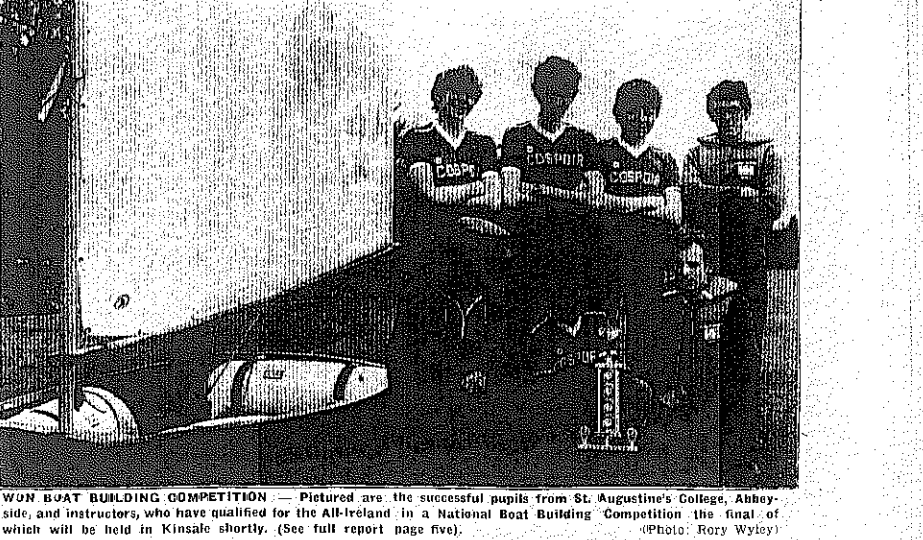
WON BOAT BUILDING COMPETITION - Pictured are the successful pupils from St. Augustine's College, Abbeyside, and instructors, who have qualified for the All-Ireland in a National Boat Building Competition the final of which will be held in Kinsale shortly. (See full report page five).