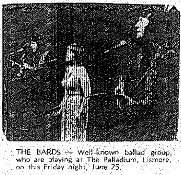
THE BARDS — Well-known ballad group, who are playing at the Palladium, Lismore, on this Friday night, June 25.