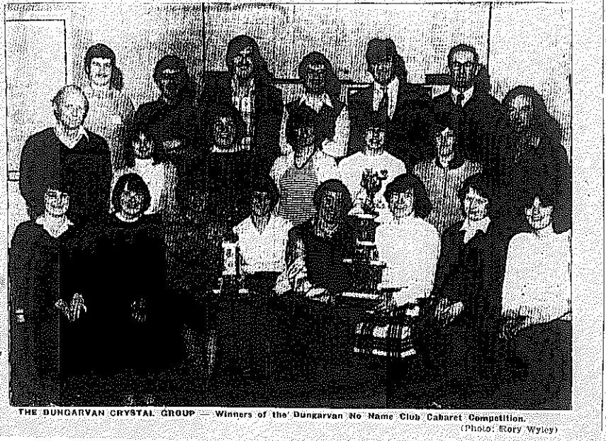
THE DUNGARVAN CRYSTAL GROUP — Winners of the Dungarvan No Name Club Cabaret Competition.