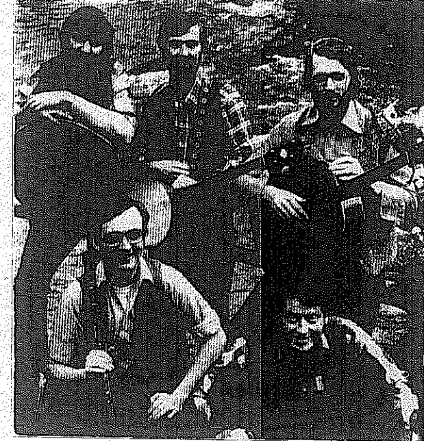
BODHRAN — Playing at Hayes, The Pike, on to-morrow Friday night, June 25

Dungarvan Macra extends its congratulations to winners of all competitions and we thank everyone who attended the field evening and helped make it such a success. — P.R.O.