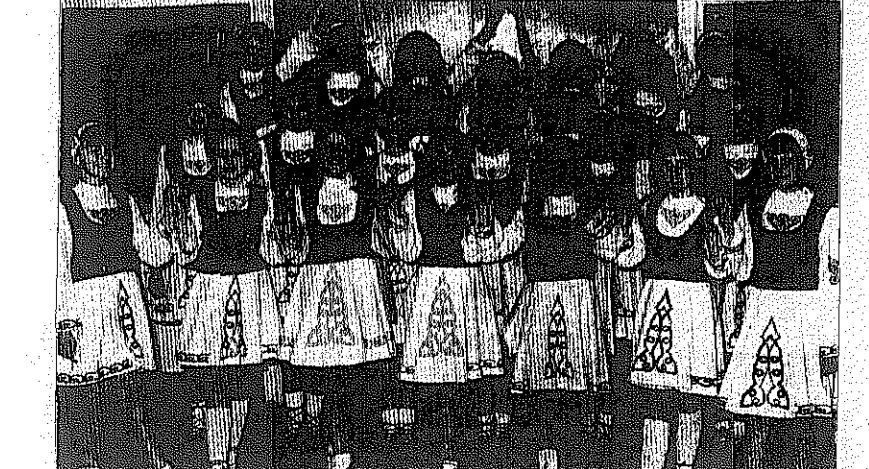
TRIPLE MUNSTER CHAMPIONSHIP WINNERS—Children of the McGrath School of Dancing (Dungarvan) who scored a triple success in the Munster Oireachtas held in the Bridge Hotel, Waterford, recently, by winning the Invention Dance 0/14, Choreography Dance (open to any age) and Senior Figure 8-hand dance 0-16.

Well fertilised grass will carry 15 to 18 cwt of beef to mid June.