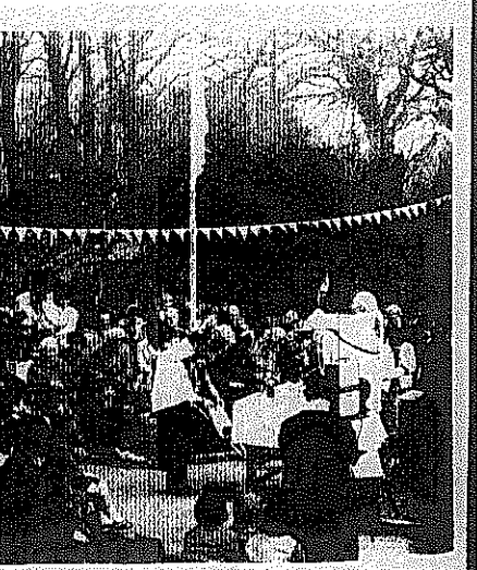
The scene during Benediction of the Blessed Sacrament following the Blessing of the Statue of Our Lady in the Abbeyside National School grounds