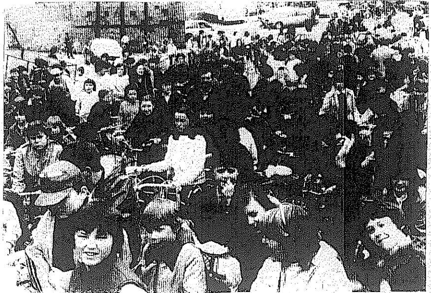
WAITING FOR THE START — Some of the cyclists who took part in the Dungarvan Lions Club 20-mile sponsored cycle on Easter Sunday waiting for the start at Dungarvan Car Park. (See "Spotlight" Column for story.)