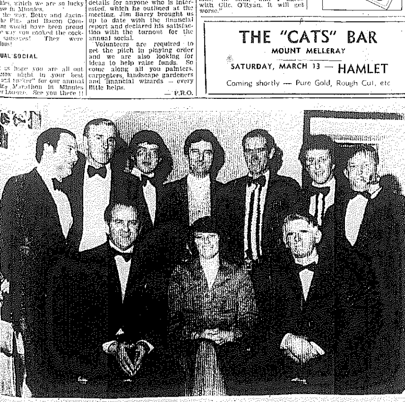
The Committee of the Dungarvan Harriers Hunt at their Annual Hunt Ball held at Whitechurch House Hotel recently.