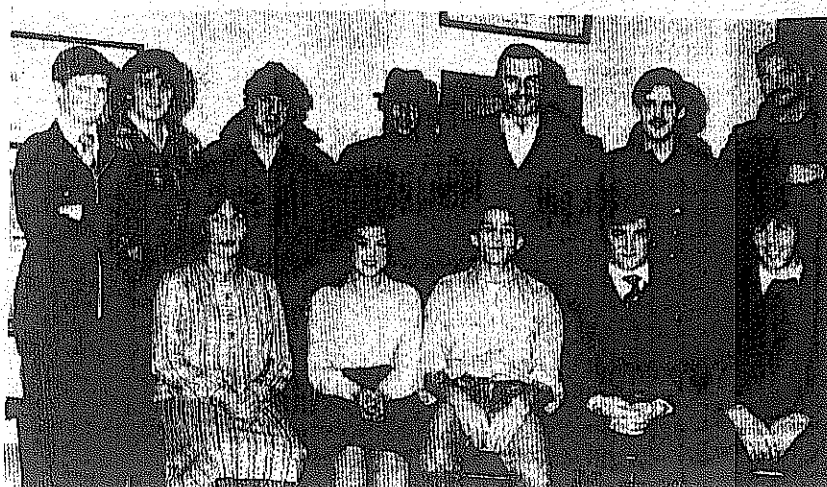
Pictured are the cast of the play 'A View From The Bridge' by Arthur Miller, which was performed by Ballyduff Drama Society...

SATURDAY, MARCH 13 - HAMLET Coming shortly - Pure Gold, Rough Cut, etc