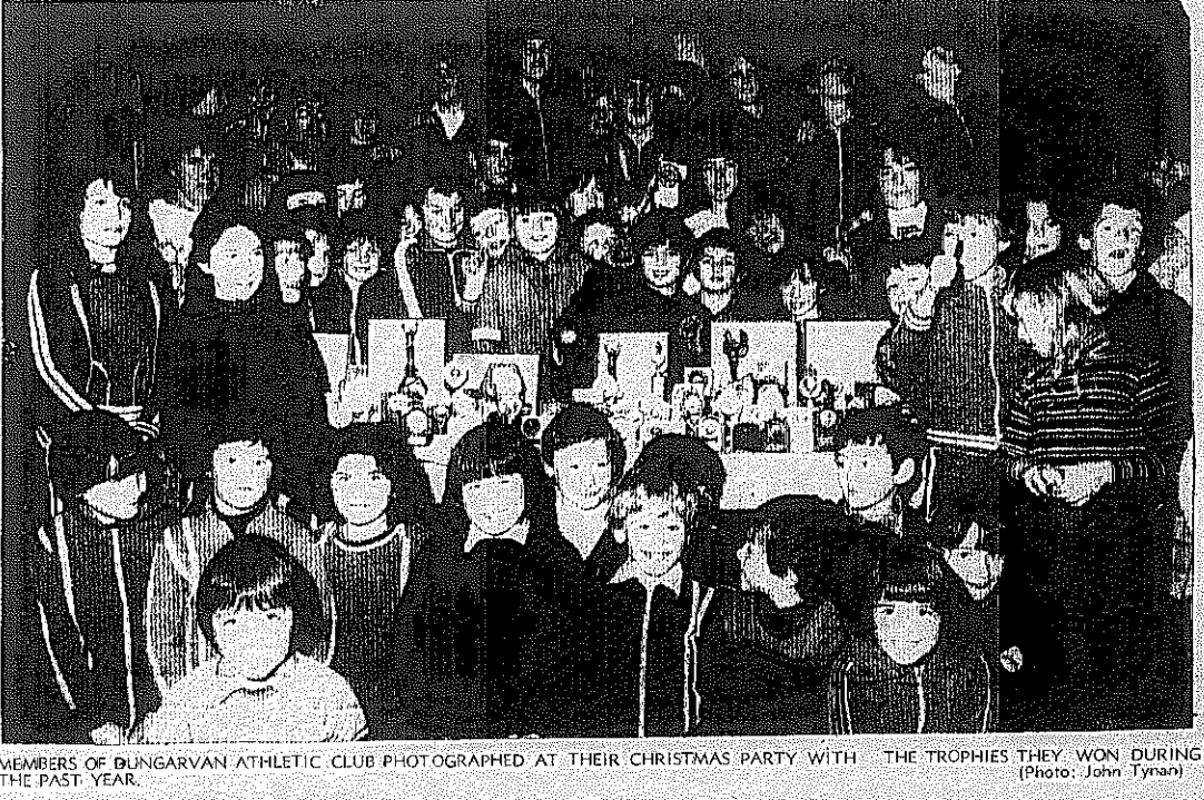
MEMBERS OF DUNGARVAN ATHLETIC CLUB PHOTOGRAPHED AT THEIR CHRISTMAS PARTY WITH THE TROPHIES THEY WON DURING THE PAST YEAR.