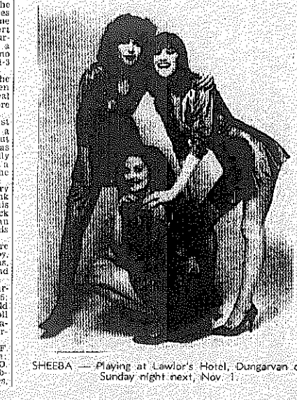
SHEEBA—Playing at Lawlor's Hotel, Dungarvan on Sunday night next, Nov. 1.