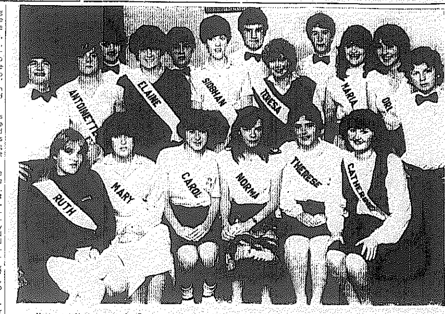
Hosts and Hostesses at the Dungarvan No Name Club Cabaret in Lawlor's Hotel.