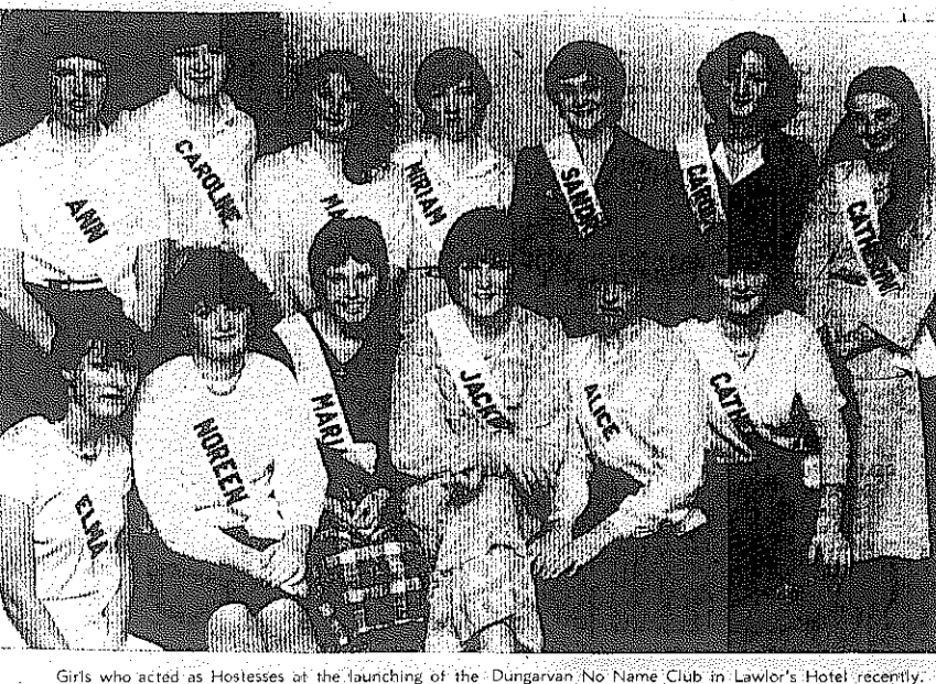
Girls who acted as Hostesses at the launching of the Dungarvan No Name Club in Lawlor's Hotel recently.