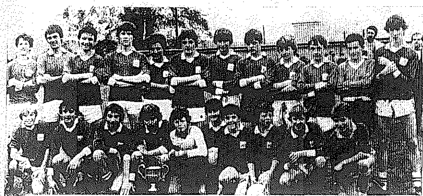
DUNGARVAN — County Junior Football Champions 1981.