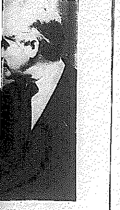
Coming programmes on the Mean Scoil, San...