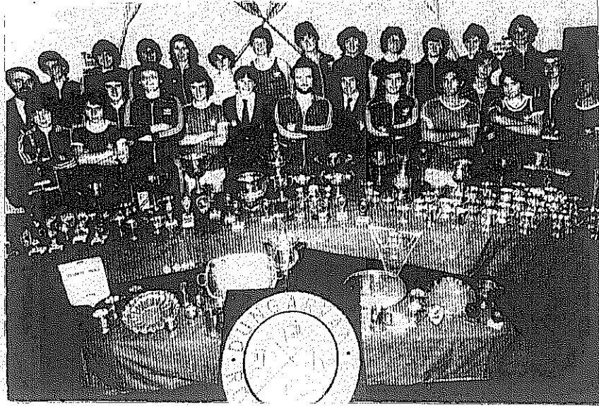
Members of the Dungarvan Rowing Club with trophies won at Regattas throughout the country during the past season.