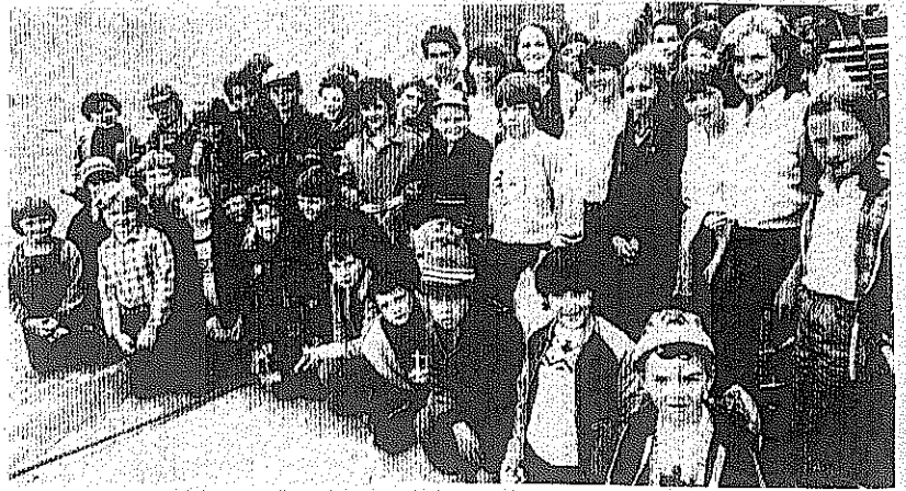
Young Anglers who took part in the Dungarvan Sea Angling Club's Special Juvenile Competition held recently.