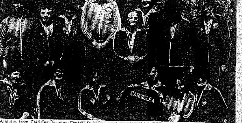
Athletes from Carriglea Training Centre, Dungarvan, who won medals at a special Sports at Moore Abbey, Monastereny recently.

BUIDHALO O CHROI — Tallow G.A.A. Club offer sincere thanks to all who so generously contributed to last Sunday's annual collection. Go meadla Dia blur stor.