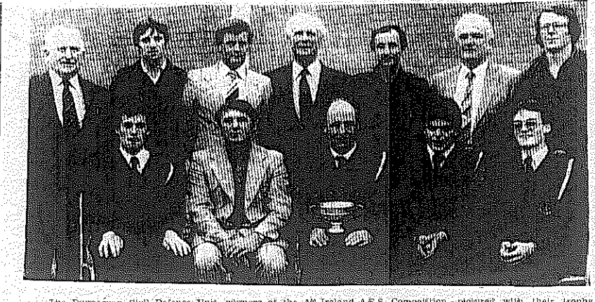
The Dungarvan Civil Defence Unit, winners of the All-Ireland A.F.S. Competition, pictured with their trophy and officials of the Co. Council.