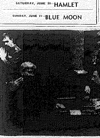
A scene from the Irish Theatre Company's production of Denis Johnston's 'The Boyne and the Sunset' which will be in the Theatre Royal, Waterford from June 22 to 24.

SATURDAY, JUNE 20 — HAMLET SUNDAY, JUNE 21 — BLUE MOON