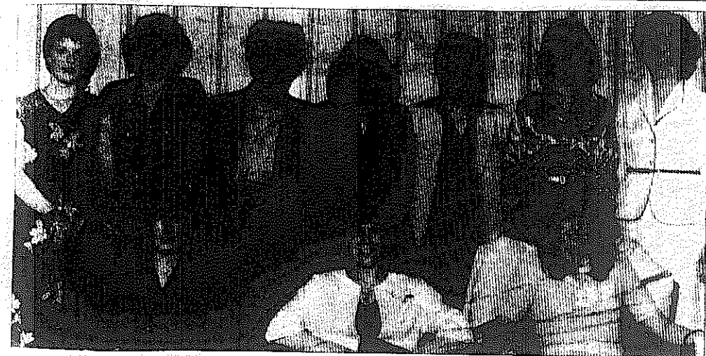
Above and below are some of the competitors who took part in Dungarvan Youth Club's 'Miss Dungarvan '81' Competition. The final takes place in Minnies, Abbeyside, on to-night Thursday, April 30.