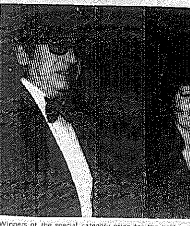
Winners of the special category prize for the best project by a club's Ladies G.A.A. Club of the Year Awards, 1980, were Abbeyside/Ballinacourty. The club receive a development grant of £200.