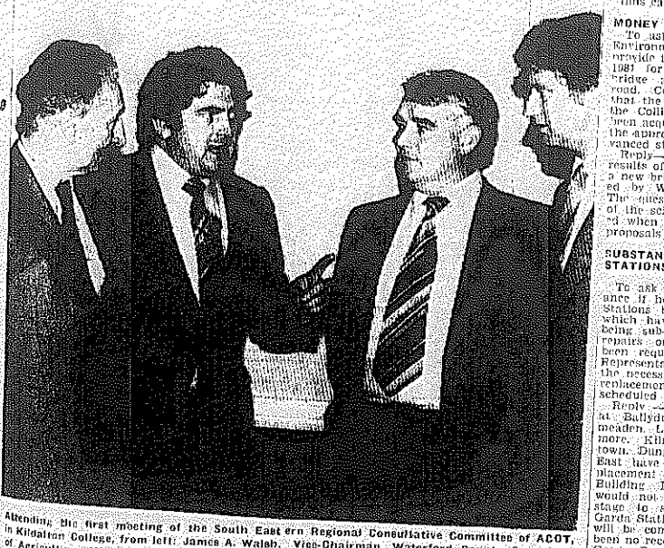
Attending the first meeting of the South East Regional Consultative Committee of ADOT...