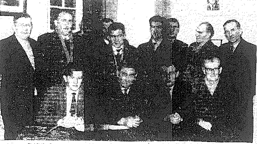
FLASHBACK TO THE SIXTIES — A former committee of the Coursing Club