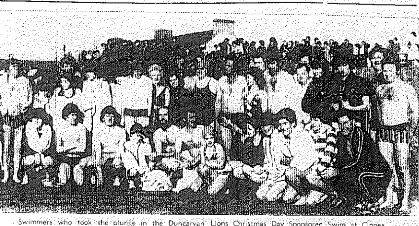
Swimmers who took the plunge in the Dungarvan Lions Christmas Day Sponsored Swim at Clonca.

The wagons were extensively damaged and a section of the track was badly torn up. A CIE break-down crew commenced clearing the track on Tuesday and an investigation into the cause of the derailment is being carried out.