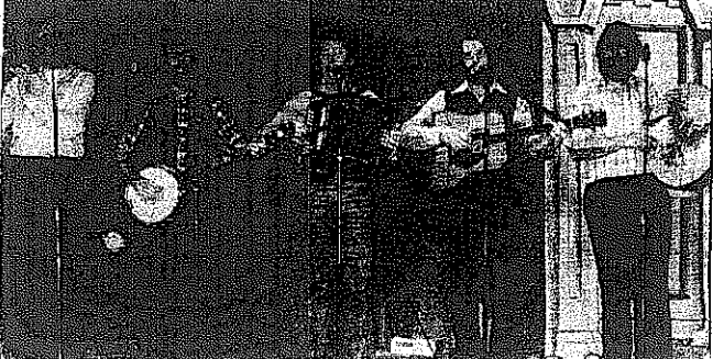
BODHRAN — Photographed at a recent concert.