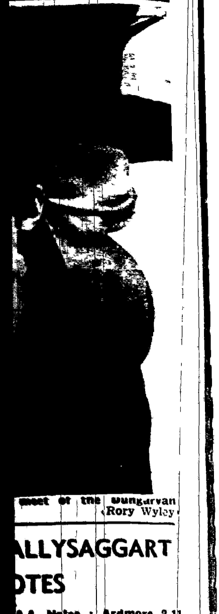
Portrait of the author of the local news column.

Our weekly card game is going from strength to strength and it is proving to be a great night out for all club members.