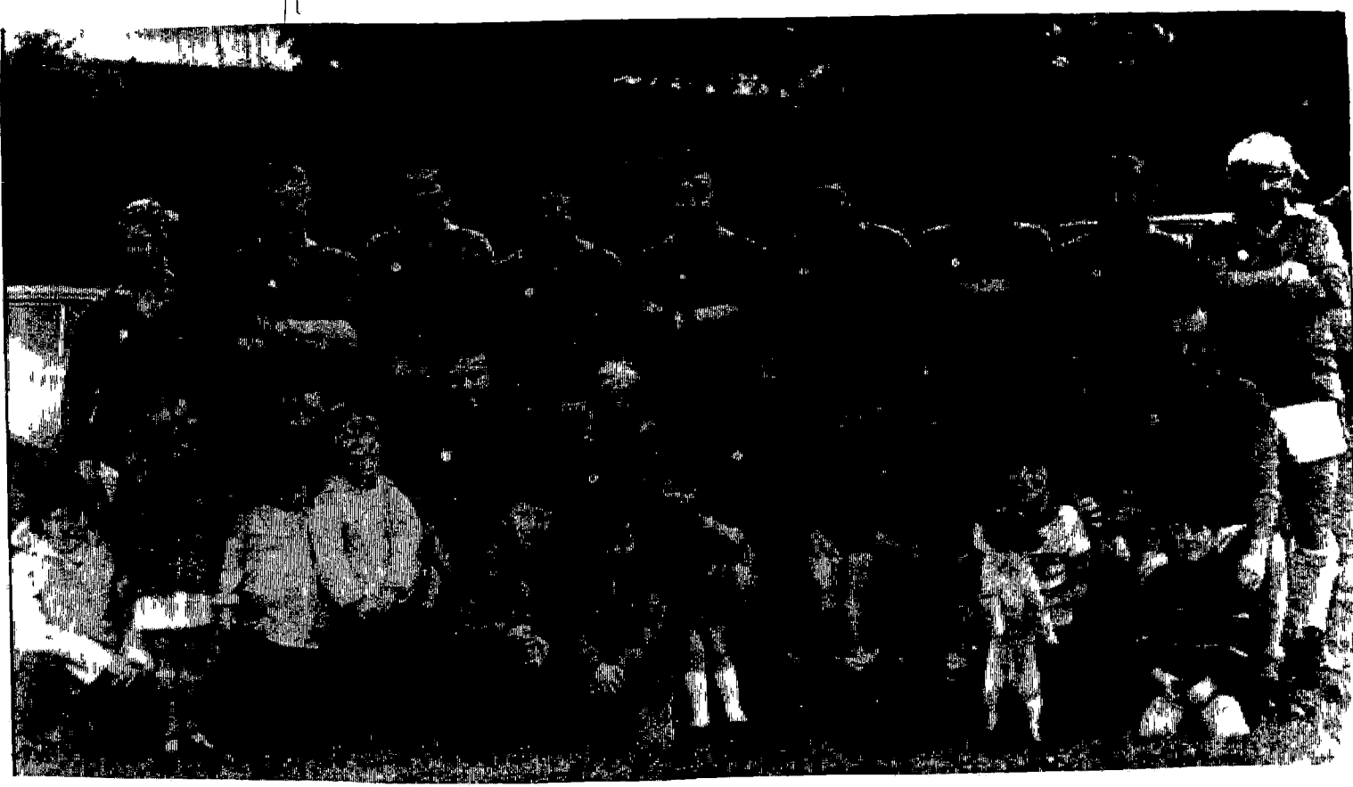
The veterans who beat the juniors in the Waterford Co-op Sports Clubs Annual Football Tournament at Bushy Park recently

11:00-Mass From Mount St Joseph Abbey Roscrea 6:15-Carroll's Irish Open Golf 6:55-Switch On News Headlines followed by a survey of fruit and vegetable prices 7:05-The Bugs Bunny Show 7:30-The Amazing Years Of Cinema 8:00-Trapper John M.D. 8:50-The English Garden 9:20-Tell Me 9:50-The Year Of The Profit 10:45-Newsnight 11:00-Preriere