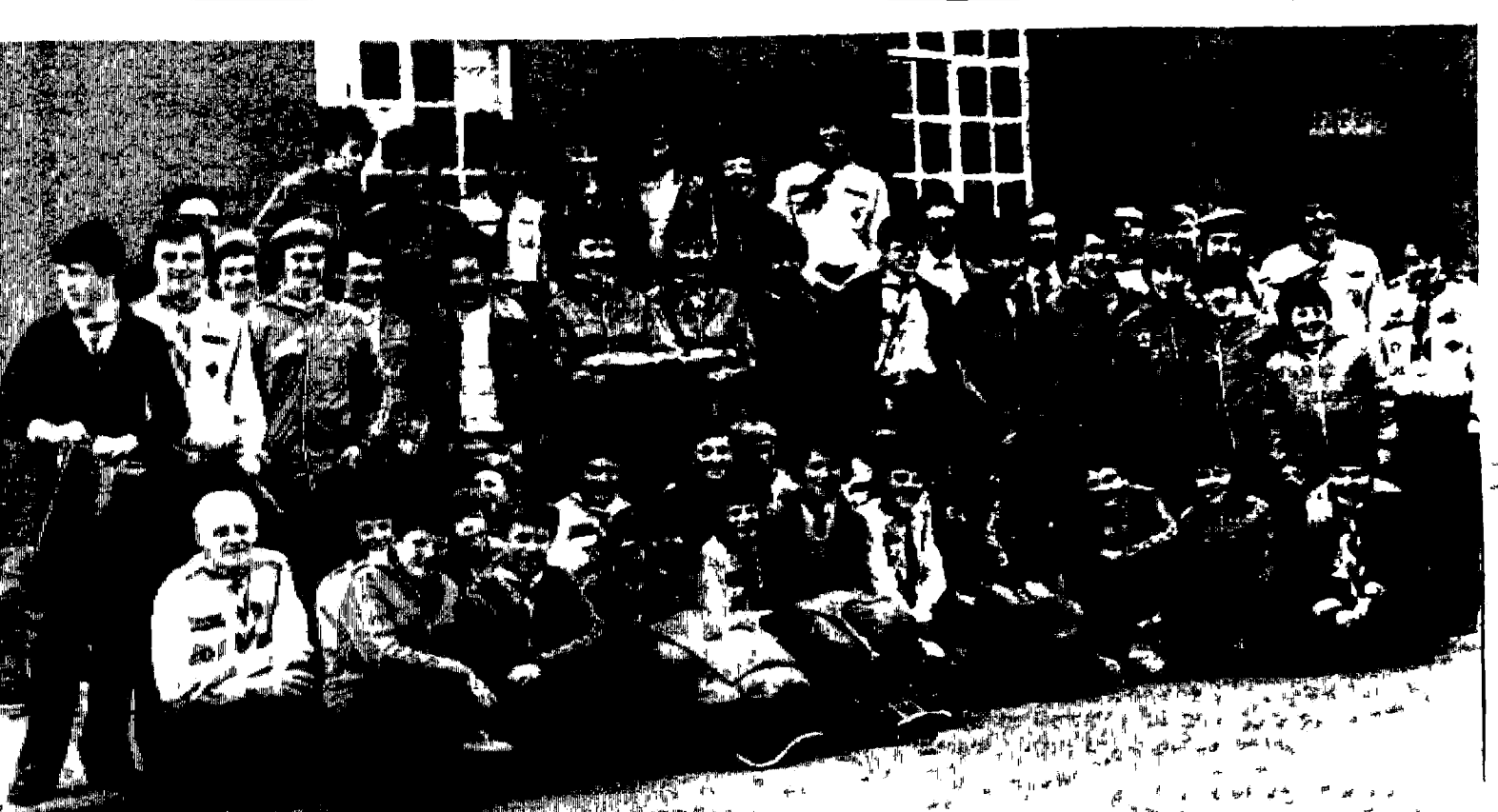
Scouts of the Abbotside (4th Waterford) and Dungarvan (11th Waterford) Units C.B.S.I. pictured at Abbotside Den before leaving for summer camp in France

PENTAX CAMERAS THE FULL RANGE OF THE WORLD'S TOP SELLING 35mm SLR CAMERAS now in stock at— RORY WYLEY'S CAMERA SHOP 17, O'CONNELL STREET, DUNGARVAN Phone 058-42059