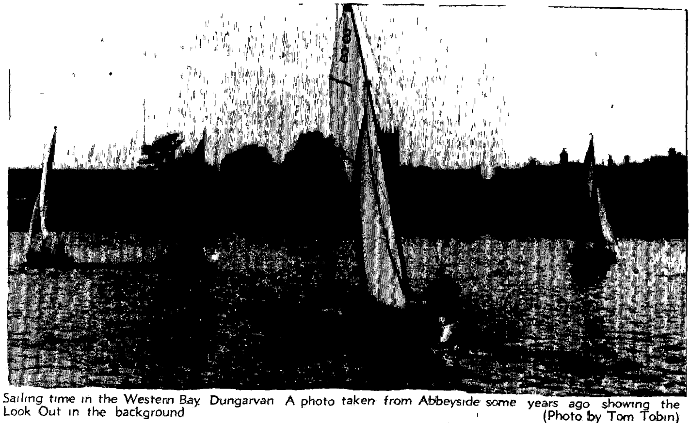
Sailing time in the Western Bay Dungarvan. A photo taken from Abbesside some years ago showing the Look Out in the background