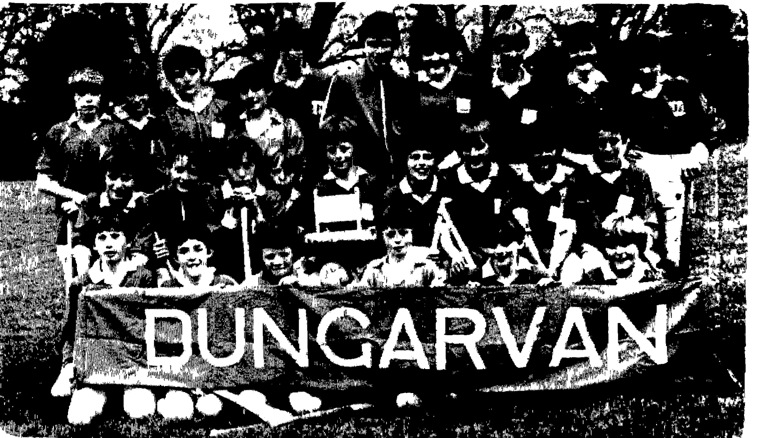
DUNGARVAN U-14 HURLERS WHO WILL REPRESENT WATERFORD IN THE FEILE NA GAEIL FINALS IN GALWAY

On Sunday, June 1 our race from Girvan Scotland with the Munster Federation proved to be a very hard race indeed. The birds were held on Saturday and liberated on Sunday morning at 6:30 a.m.