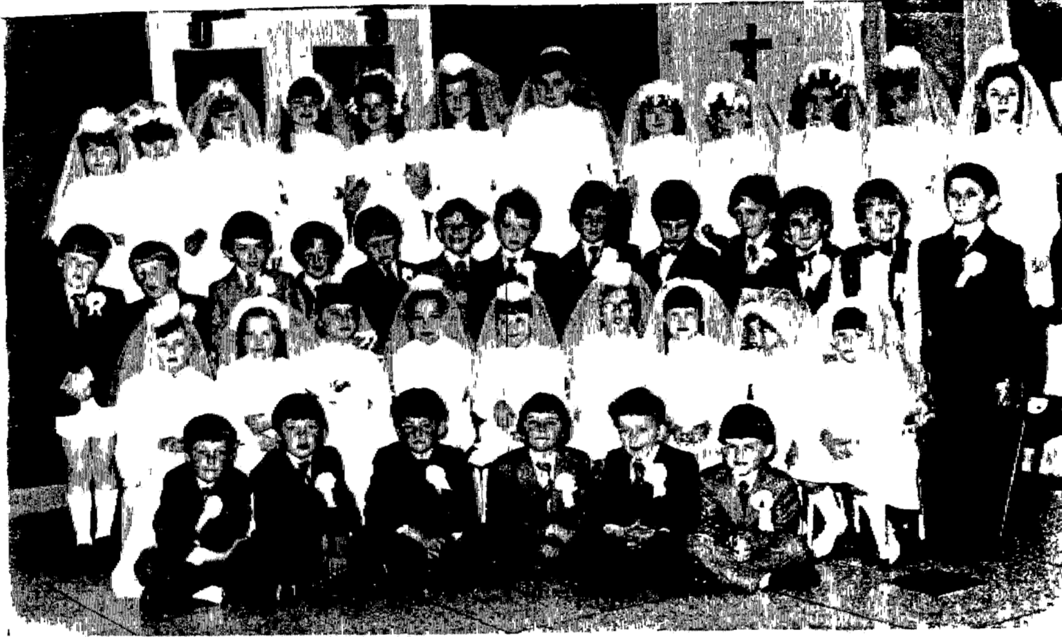
Boys and girls of the Mercy Convent School Dungarvan pictured after receiving First Holy Communion in St Mary's Parish Church