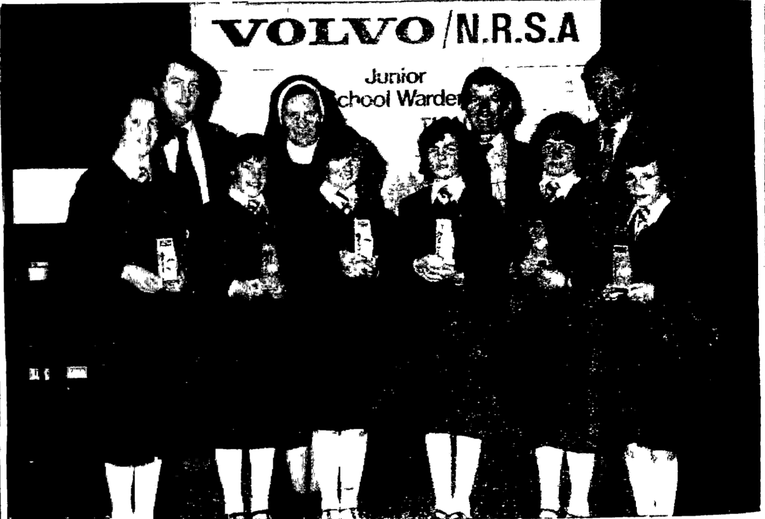
Dungarvan School Compete In Junior Warden Final

In some makes of helmet there are two strap closing arrangements—one with chin cup and the other without For safety both should be used